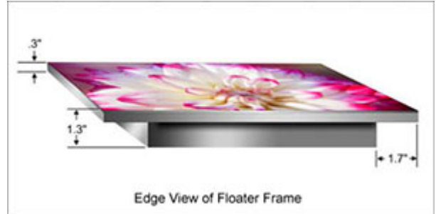
Back of a floating frame for contemporary fine art prints