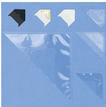
Lineco Archival Mounting Corners http://www.dickblick.com/products/lineco-archival-mounting-corners/