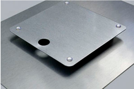
Back of a hanger frame for contemporary fine art prints

Nancy Scans laminates, mounts on Gatorboard, Sintra, Plexiglas, Aluminum http://nancyscans.com/fine-art-exhibition/finishing